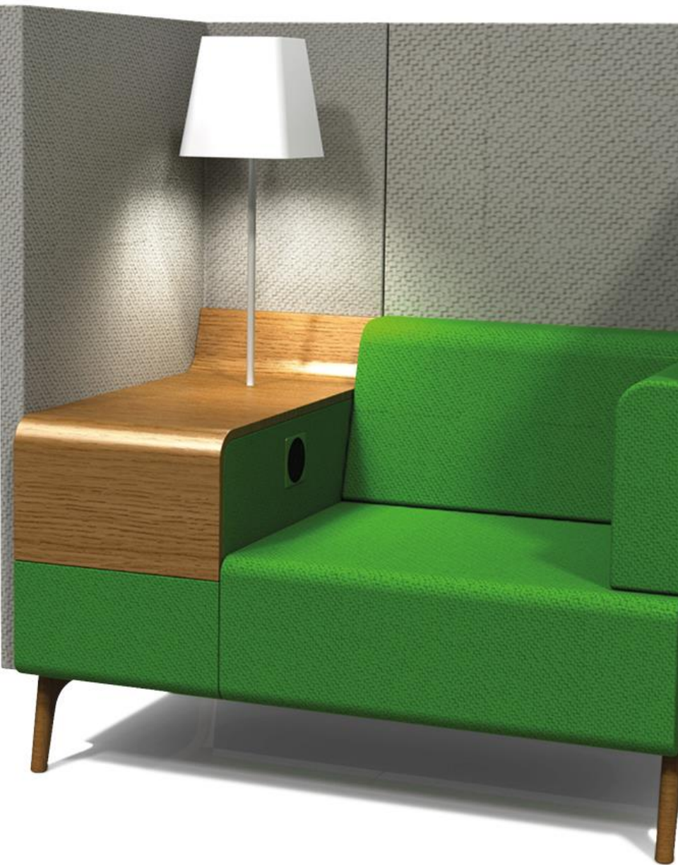
D&G OFFICE INTERIORS