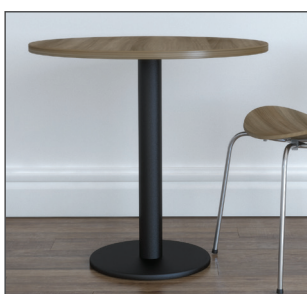
Round Black Base