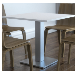
Flat Brushed Stainless Steel Base