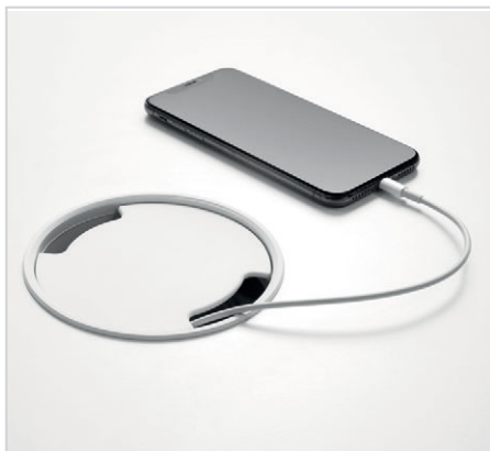
Power and access options