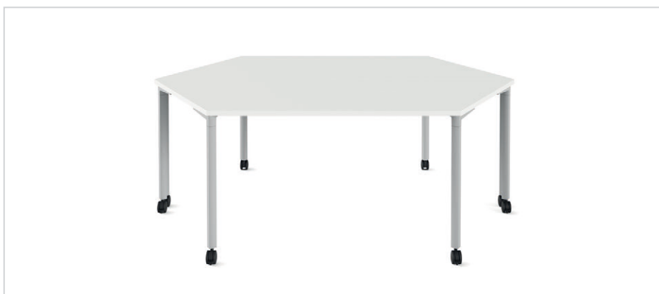
Training tables including trapezoid shapes with castors

For full features and options available for Everywhere Tables, please visit hermanmiller.com