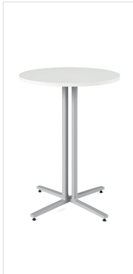
Tables to support collaboration from standing height to conference tables