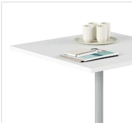
Café and occasional tables