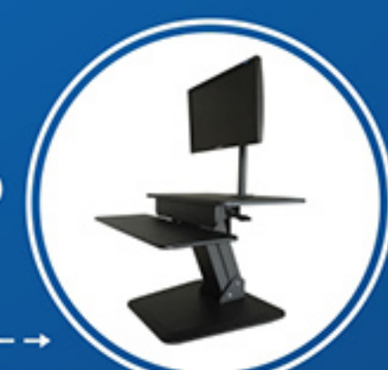
GSS03BAS+MMS10S STAND WORKSTATION