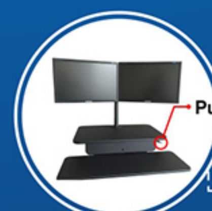
GSS03BAS+MMS10D SIT WORKSTATION