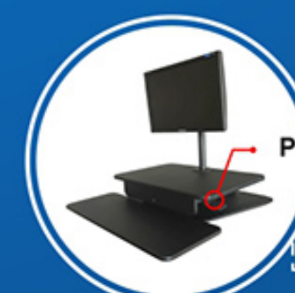
GSS03BAS+MMS10S SIT WORKSTATION