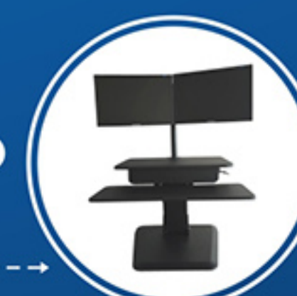
GSS03BAS+MMS10D STAND WORKSTATION